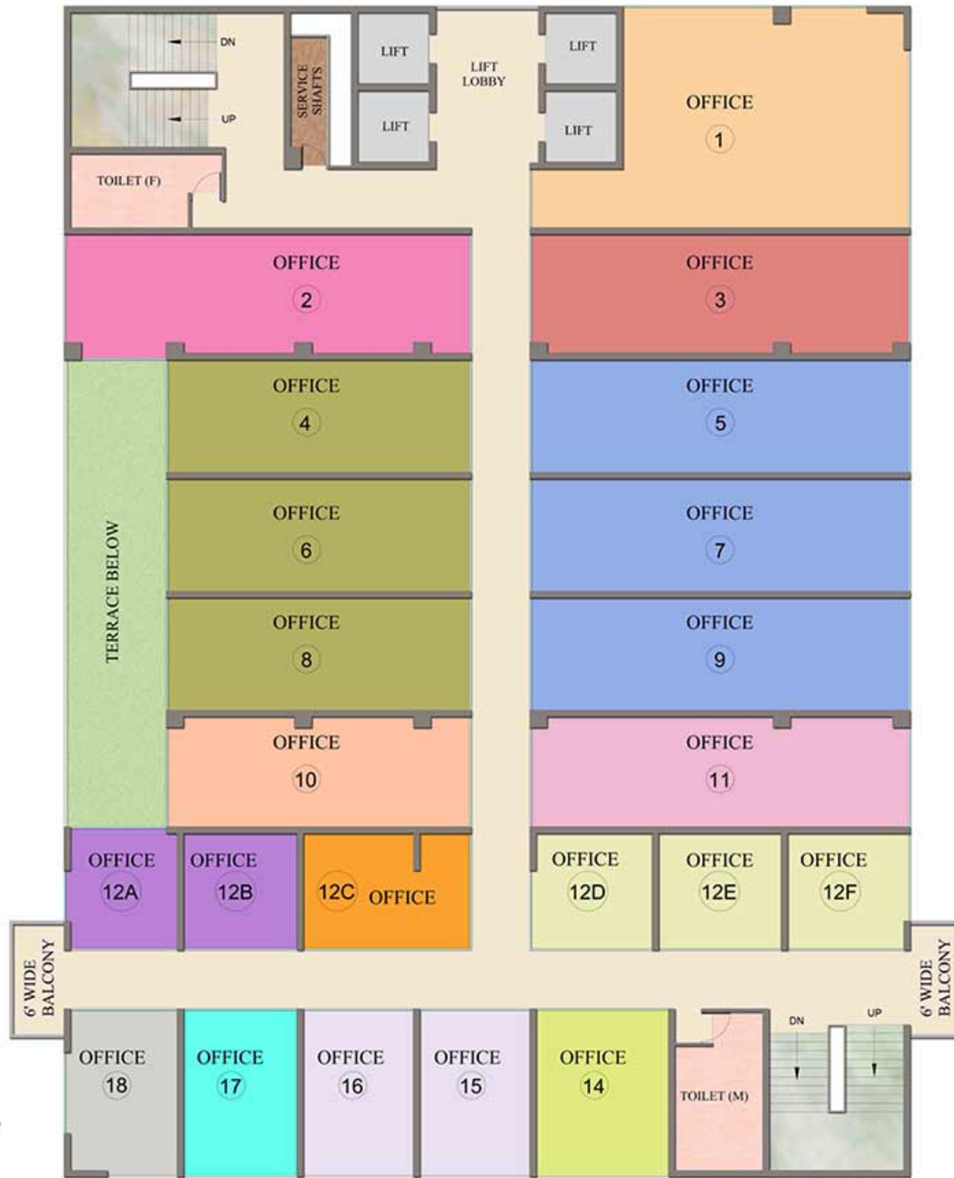
TOWER-A 5TH TO 12TH FLOOR PLAN